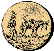
Inductees from Mining's Past

2021 Inductees from Mining's Past (miningfoundationsw.org)