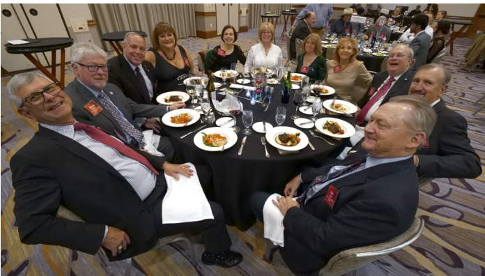
Everyone at the AIME SME table was having a good time as AIME received a Special Citation for its 150th Anniversary.