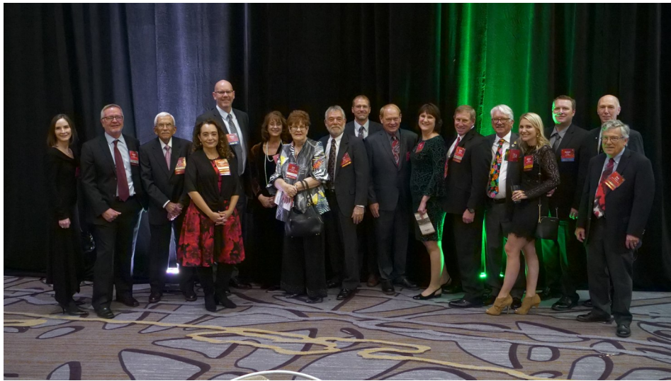
Members of the MFSW BOG and HOF Committee gather together after the banquet for a photo.