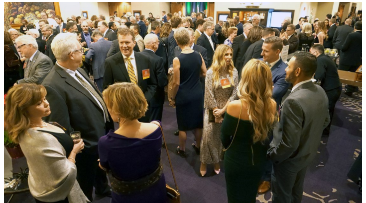
A crowd of 400 mingled prior to the start of the program., Everyone was very happy to see one another after a two year hiatus.