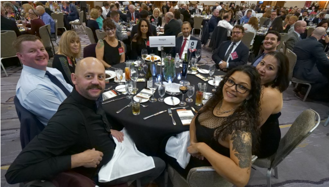
Diamond Sponsor Hexagon hosted a table and were thoroughly enjoying the evening.