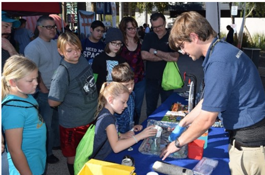
Participating in the electrowinning process.