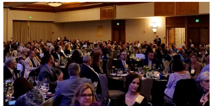
It was a full house at this years American Mining Hall of Fame Banquet.