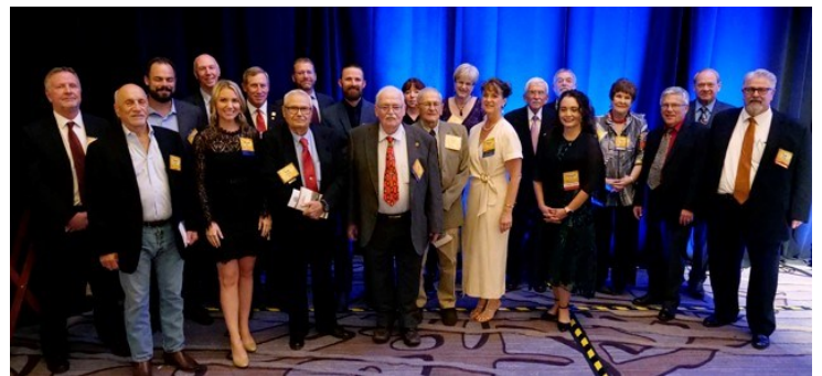
Members of the MFSW BOG and HOF Committee gather together after the banquet for a photo.