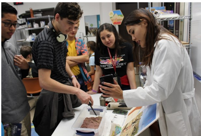
12th grade student learn about exploration in the Mineral Resource Discovery workshop at Flandrau Planetarium

Open slots for the Mineral Resource Discovery workshop, hosted at the Flandrau Planetarium, are filling up quickly with only two open slots remaining in February. Our University of Arizona student volunteer instructors will complete their training during the last week of January. They are excited to start teaching when the first workshop starts on February fourth.