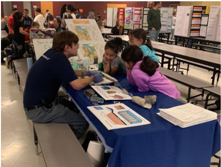
Students learn about the importance of copper and how we refine it.