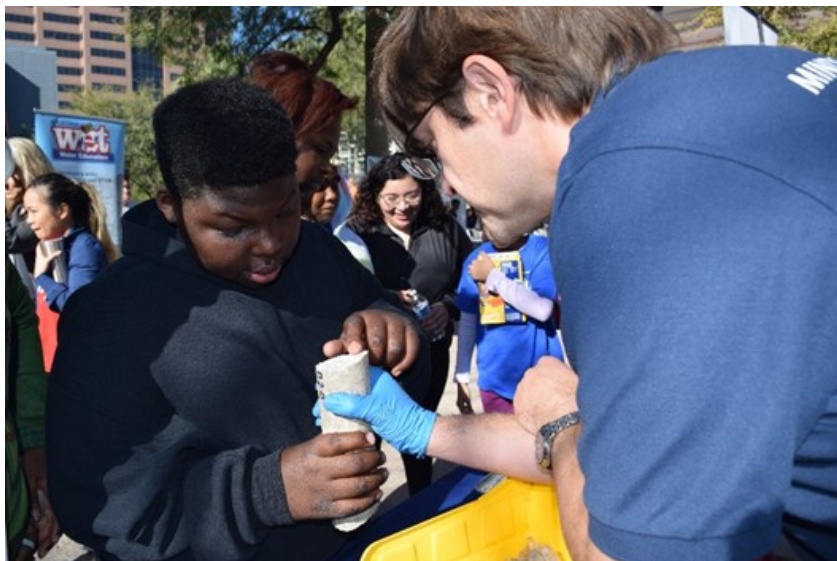
Learning about how we find mineral resources.

On January 25th the Lowell Institute for Mineral Resources ran a table electrowinning experiment at Connect2STEM, the SciTech kickoff event for 2020. Over 300 students in grades 4 to 12 stopped by our table to learn about how important mineral resources are in our lives, how we get the copper we need, and careers available in the mineral resource industry. The event was hosted at the University of Arizona College of Medicine in Phoenix and gave us a great opportunity to connect to the citizens of the valley.