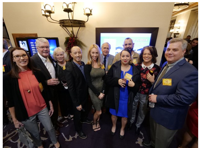
The Pioneer Equipment team took this opportunity to gather together to celebrate the industry achievements.