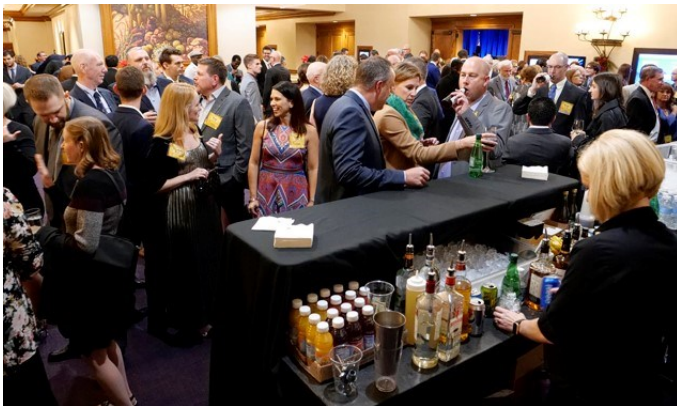
There was quite a crowd enjoying the cocktail hour prior to the dinner and program honoring this years Inductees.