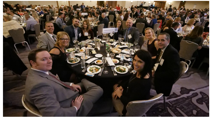
Komatsu, the 2012 Industry Partnership Award winner has also been a regular at the banquet for many years.