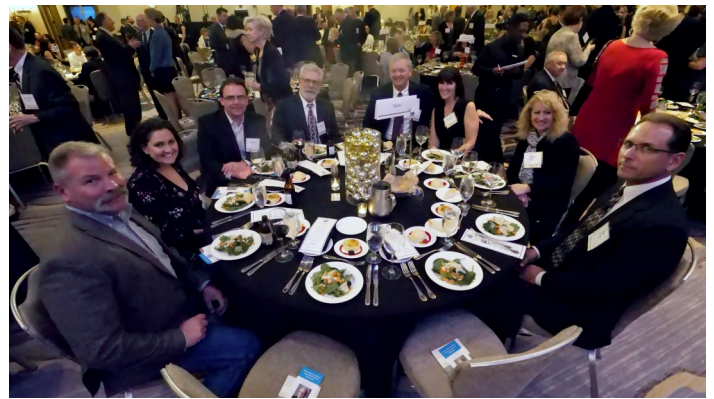
Our Diamond sponsor Epiroc was out in full force to enjoy the evening, renew old acquaintances and make new friends.