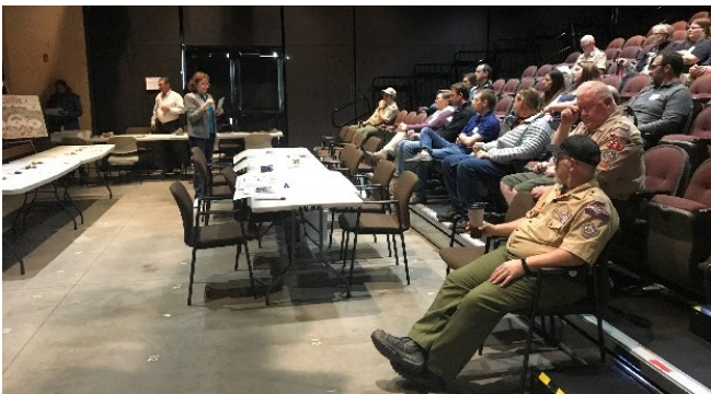
Training the volunteers: Sierrita

There were two Mining in Society merit badge workshops at Freeport-McMoRan facilities, Miami and Sierrita. These workshops continue to be well received and evaluations are overwhelmingly positive. The added benefit of these events, is that we also reach the parents of the scouts, helping them understand how important mining is to their way of life. The management at CalPortland Plant is interested in doing a similar event at their facility, so a representative attended the workshop to see how it works. I will be in discussion with them, as they move forward on what to do at their facility.