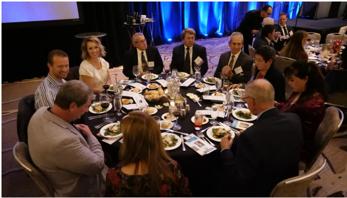
The CAID table celebrated SABC's Special Citation recognition.

More Photos at https://www.miningfoundationsw.org/page-1847263