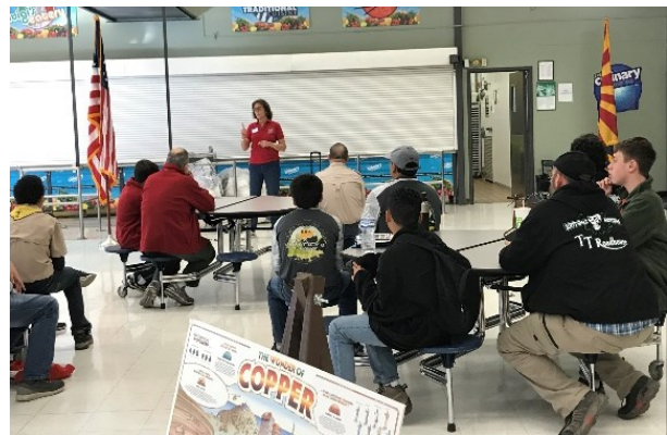
Miami: Introduction to the schedule for the day

Thank you goes out to all of the volunteers who participate in these workshops, it would not be possible without them!