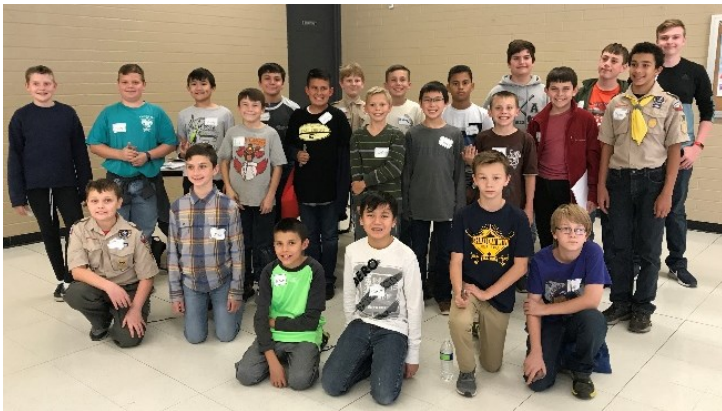
Scouts at Miami