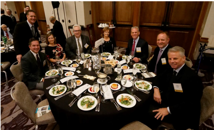
Empire Southwest, 2014 Industry Partnership Award winner has been a regular at the banquet for many years.