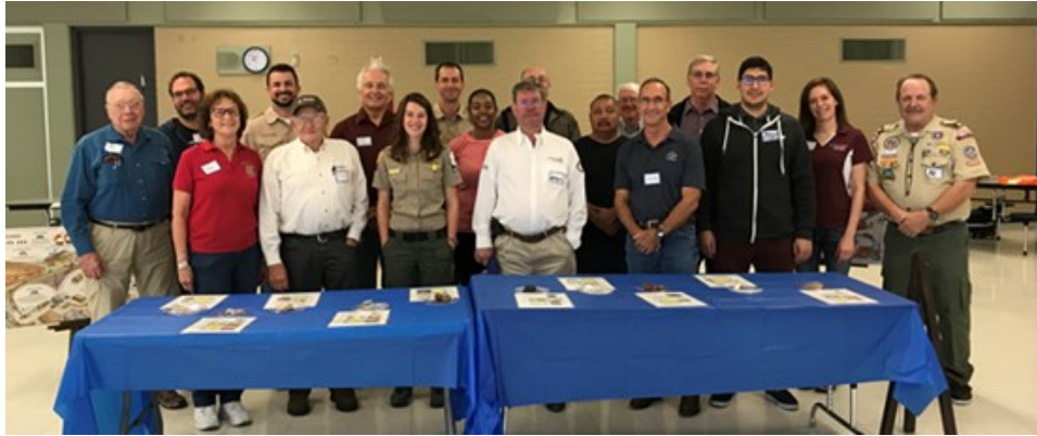
Volunteers at Miami: