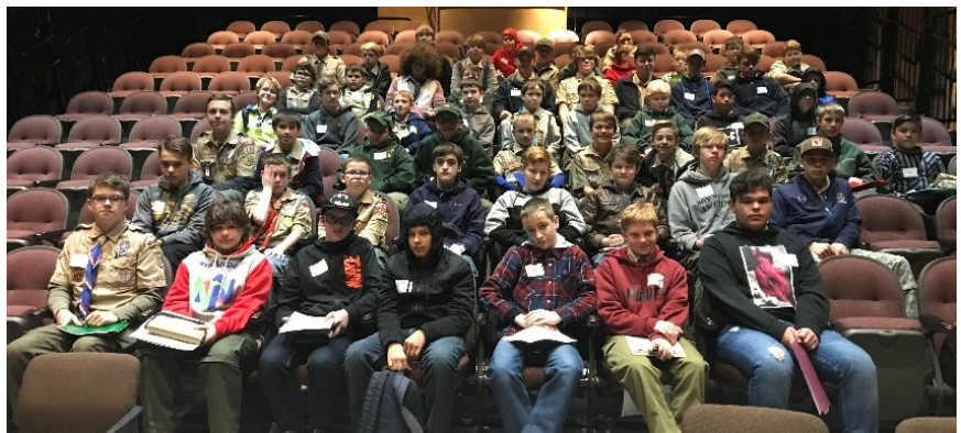
Scouts attending the workshop