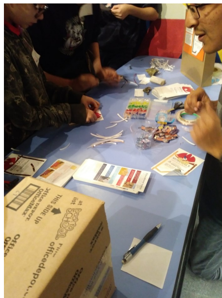
Middle schoolers constructing a paper circuit at Flandra's Science Night.