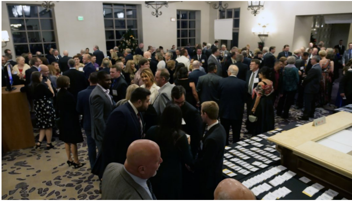
There was quite a crowd enjoying the cocktail hour prior to the dinner and program honoring this years Inductees.

More Photos at https://www.miningfoundationsw.org/page-1847263