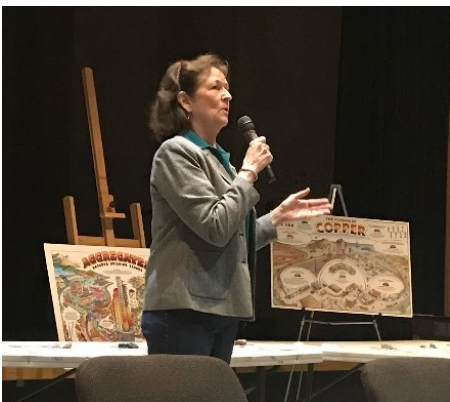
Explaining the day to the Scouts