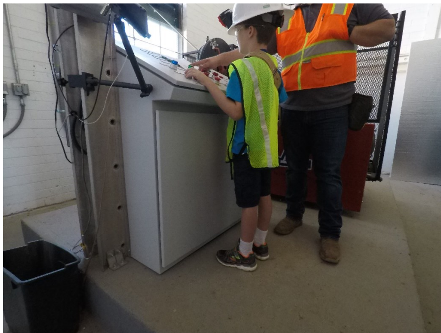
9-year old reporter from Bear Essentials News on a tour of U of A's San Xavier Mining Laboratory.