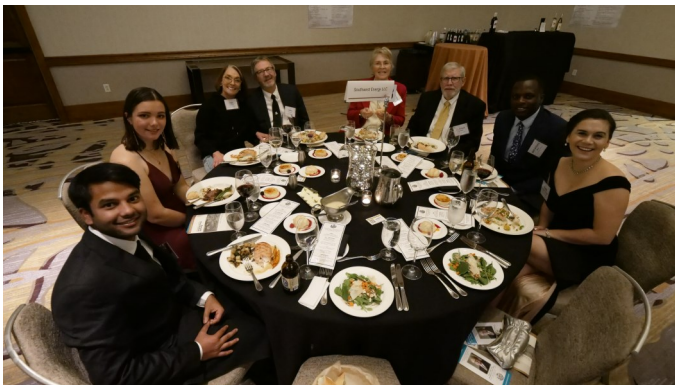
Over 50 students and professors from the University of Arizona were able to attend the banquet thanks to the generosity of our sponsors and individual members.