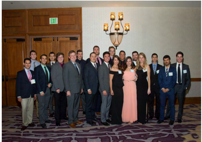
University of Arizona students - all guests of generous sponsors