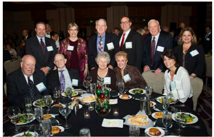
UA Global Law Center Faculty with supporters and guests