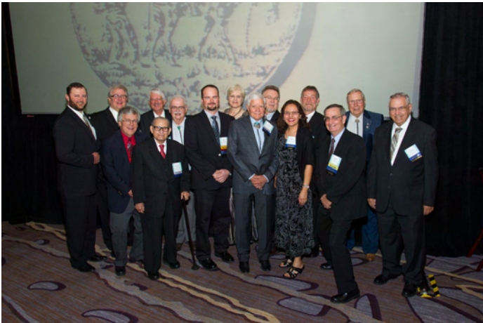
Some of the Board of Governors present at the awards banquet