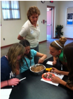
Bird seed activity in Casa Grande

School visits have been very successful this year, with repeat visits at 14 schools and 2 new schools. I also had the opportunity to participate in Imagine STEM with the Girl Scouts of America in Casa Grande. This provided me with the opportunity to present to over 300, 7-8 grade girls in three middle schools. This will also lead to presentations in classrooms at those middle schools. The chart below details the schools and students visited in late September through November, with over 2500 students, 23 teachers participating in presentations and activities.