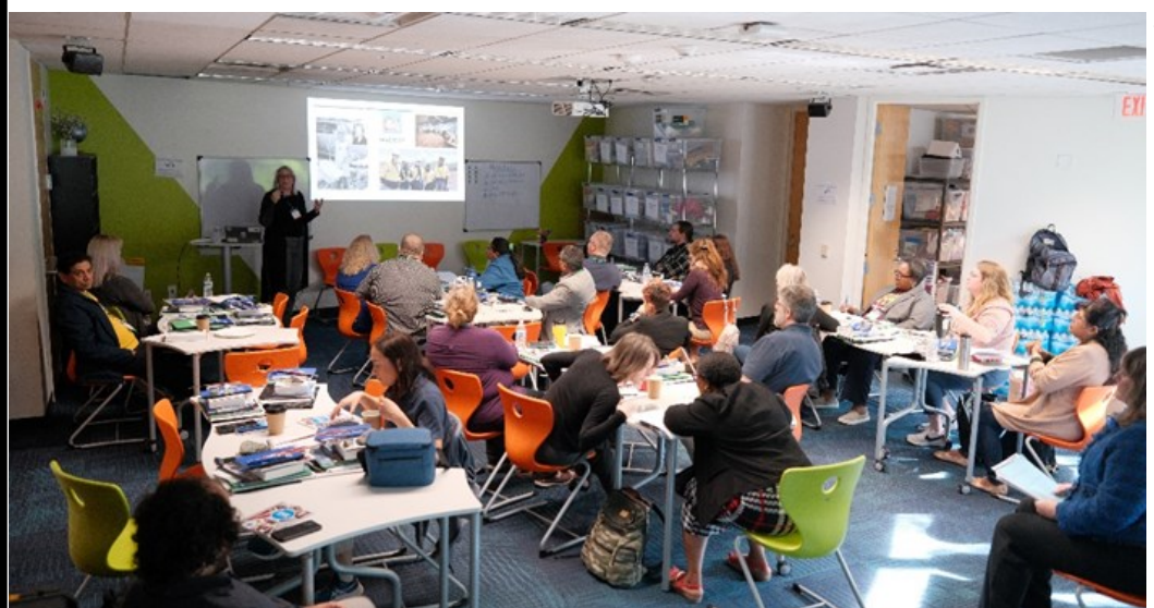
17 Arizona teachers participated in the inaugural Arizona Science Teachers Mining and Mineral Resources Workshop at SME MineXchange 2024 in Phoenix, AZ.

This spring, the outreach program sowed some new initiatives, fertilized conprograms, tinuing continued presenting throughout Arizona. The outreach team worked hard to support teachers and students in their classrooms, at STEAM events, and with new materials. These developments were all possible thanks to the support of the Mining and Minerals Education Foundation. Read on to discover what