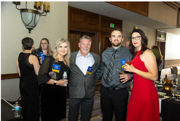
The folks from Rummel Construction eagerly wait for the program to begin.