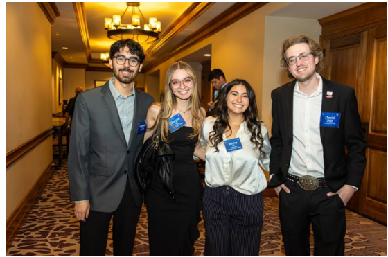
University of Arizona students were well represented.