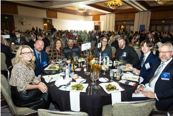
Diamond Sponsor Komatsu hosted two tables and were thoroughly enjoying the evening.