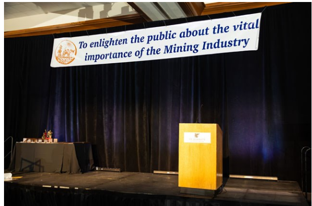
The motto of the MMEF hanging front and center for all to see.