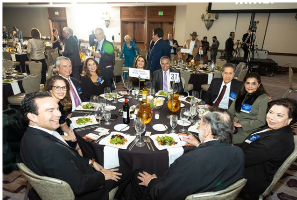
Another table of the Grupo Mexico attendees.