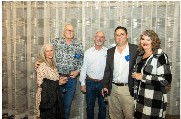
It was a good time for friends to get caught up.