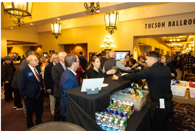
The line-up at the bar was a perfect place to talk with friends and meet new people.